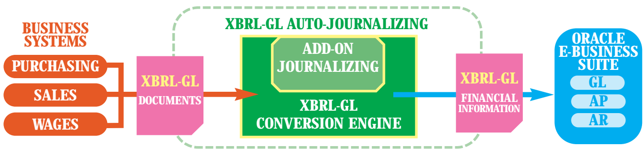
Figure 2: XBRL-GL AUTO-JOURNALIZING SYSTEM

convergence, and adoption of e-business standards. This consortium of tech firms is working with a United Nations organization to develop a common way for businesses to use XML to exchange data. (For more information on OASIS, visit www.oasis-open.org .)